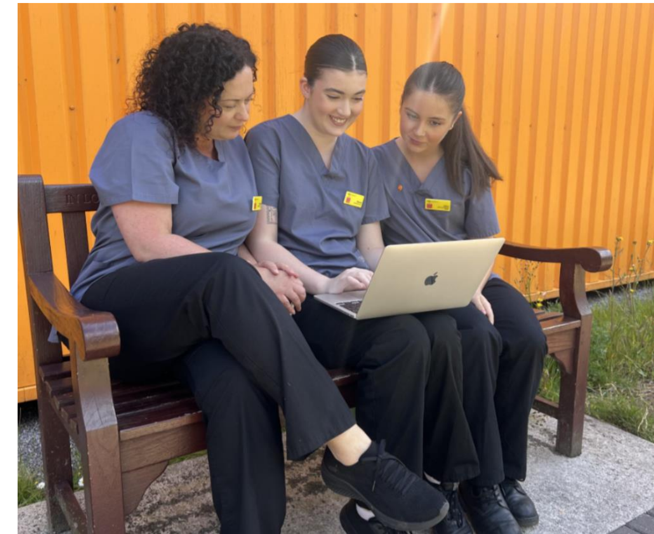
Group 3 Vert on demand workbook – focus practice questions