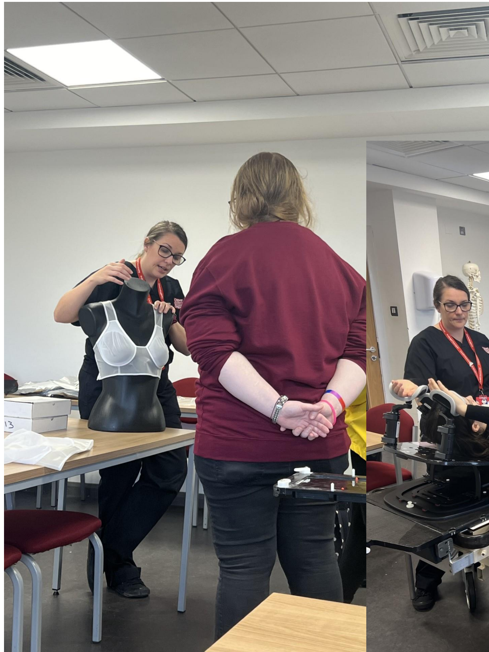
Group 1 Immobilisation workshop