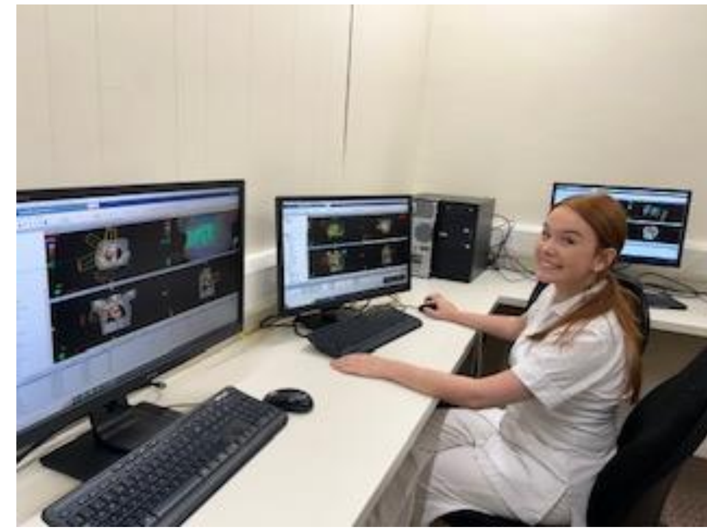
Group 2 Treatment planning – Breast technique